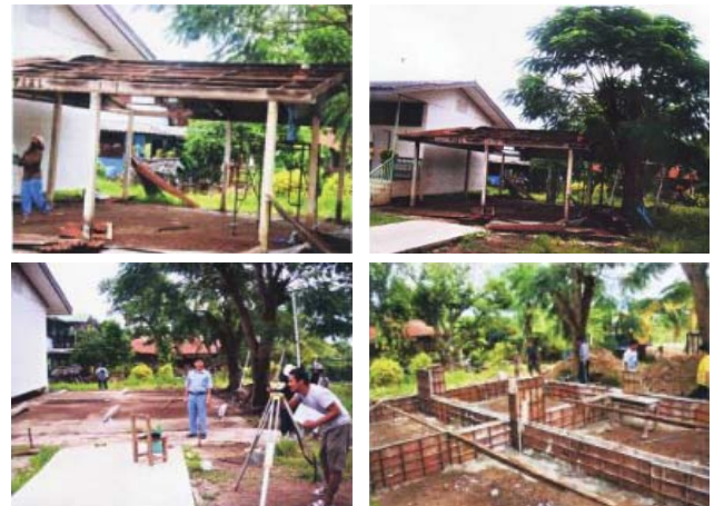
4 above: the old bicycle parking lot is being removed, beginning the construction of of the Ethics Centre