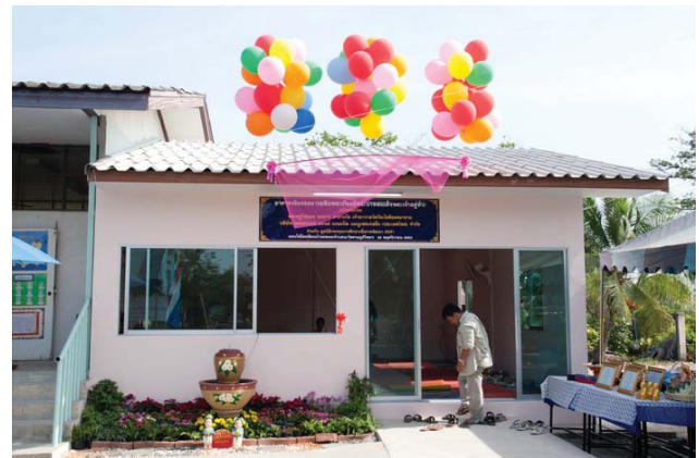
Completed Ethics Centre at Ban Khlong Chao School