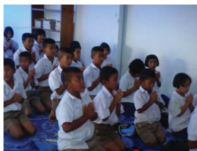
Left: Islamic students praying (Thai: ละหมาด) in the Ethics Centre