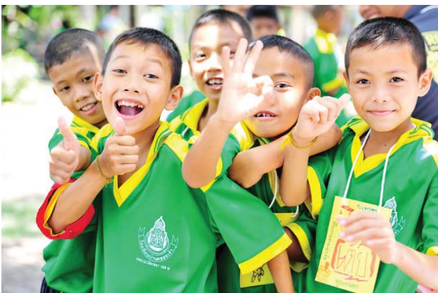
Front cover, male students at Ban Khlong Chao (Sena Wattarat Wittaya) School in Chachoengsao Province played with the camera with happiness on the 1st day of P&G Volunteering Trip 2010 when volunteers from P&G Manufacturing (Thailand) Co.,Ltd. went to visit the school and volunteered themselves on school facility maintenance.