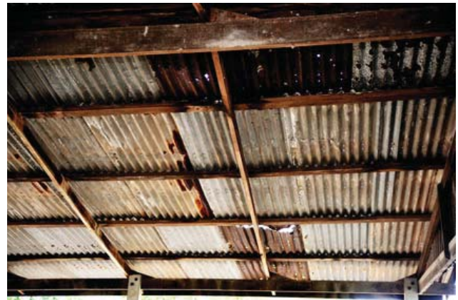
The school old bicycle parking area, rusty & leaked roofing, not safe for the children

After construction, Ethics Centre becomes the school assembly hall and a centre for holding boards that are full of good knowledge in local culture preservation for the students. Traditional musical instrument such as "Angklung, (Thai: อังกะลุง)" are kept here and the students can use it for Angklung performance too. P&G understands the centre is quite necessary for the school as it helps promote the understanding about the importance of cultural preservation properly for the students.